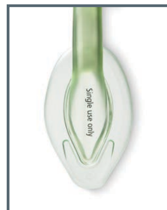
AuraOnce cuff including reinforced tip