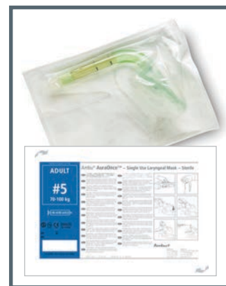
AuraOnce in pouch (IFU/colour code)