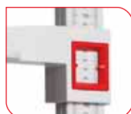
Two large windows and double-sided scale for easy readout.