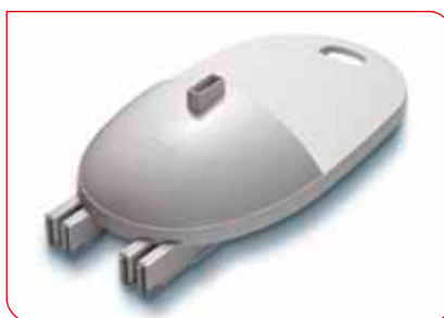
Integrated handle and secure catches on all individual parts for transport ease.