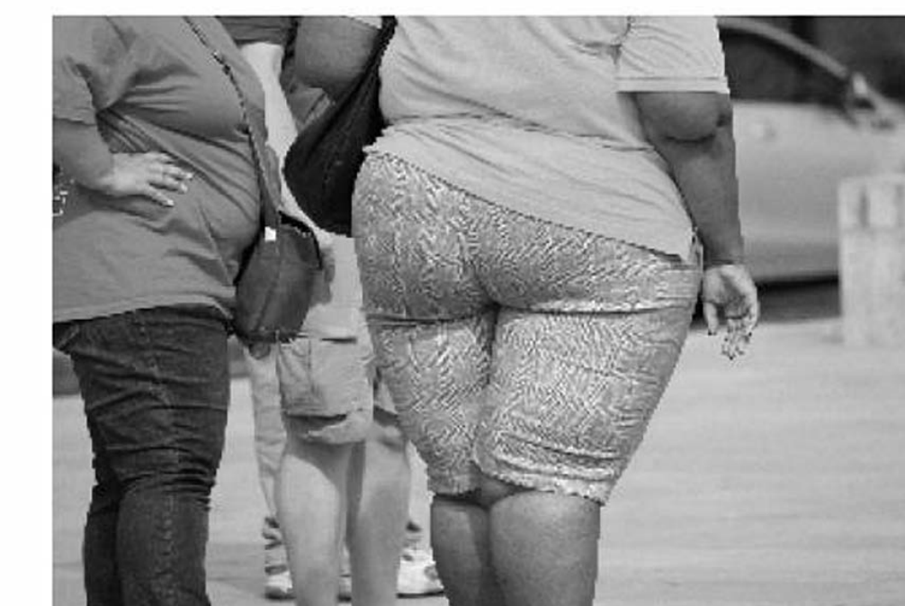
▲ Obese Person/Bloated Patient