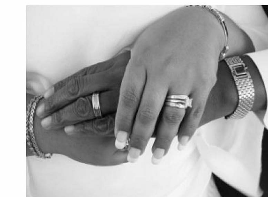
▼ Dark Skin Patient