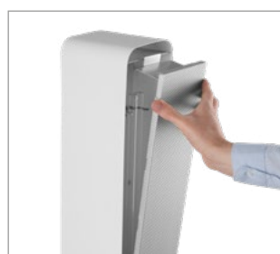
Opening the light source's cover enables direct surface disinfection.