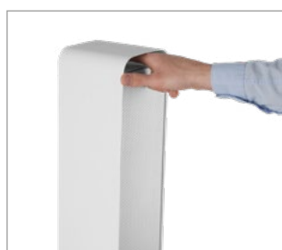
Convenient opening handle and slot for luminaire manoeuvring.

After opening the light source's cover, the lamp should be directed at the surface for a specified time to effectively disinfect it. However, it should be remembered that UV-C light is harmful to the skin and eyes. When using the lamp in this form, no one should be in the range of the light beam. Careful reading of the user manual is required before use.